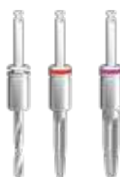
GUIDED DRILLS GD-PT-21 GD-PT-35 / GD-PT-47