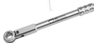
UNIVERSAL RATCHET 00376