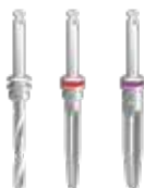
STANDARD DRILLS PT-21CUT PT-35CUT / PT-47CUT